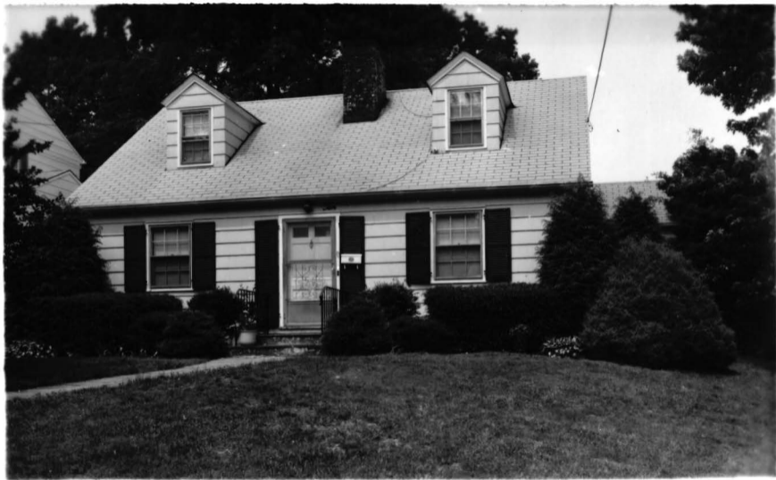
Board of Realtors of the Oranges and Maplewood